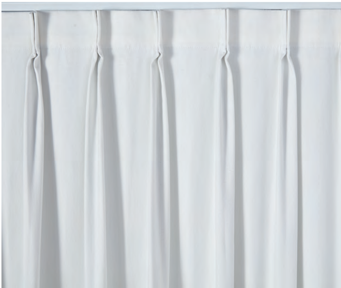
Double Pinch Pleat