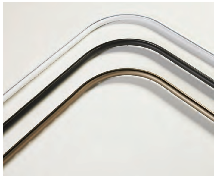
Bent Rod Tracks